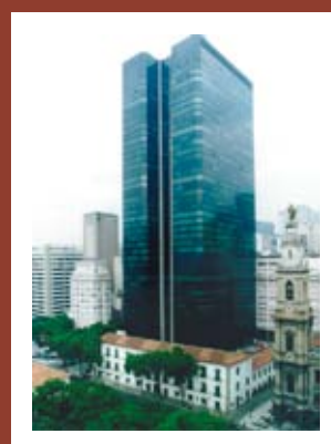
Candido Mendes University Rio de Janeiro, Brazil

Latin America Office — General Secretariat Rua da Assembleia, 10, 42º andar, Centro 20011-901 – Rio de Janeiro – RJ – Brazil Phone: +55 21 3543-6498 — Fax +55 21 3543-6501 E-mail: cmendes@candidomendes.edu.br – www.alati.com.br